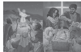
Lesson 1 Visual 4

Jesus Christ is truly the most important person in history. One reason is that He was willing to become unimportant to show His love for God the Father and us by coming to earth. Jesus set aside His own comfort and feelings and put others before Himself. He submitted to the Father’s plan for Him to be born as the Savior of the world!