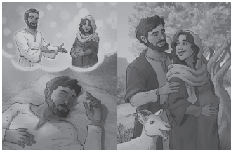
Lesson 1 Visual 2