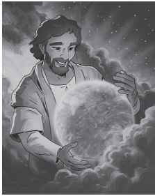
Lesson 1 Visual 1