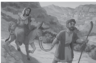
Lesson 1 Visual 3

Don't force any students to read the verse if they are unwilling to do so. If no students volunteer, read the verse yourself.