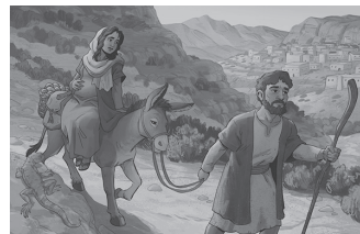
Lesson 1 Visual 3

Jesus would grow up and die on a cross as punishment, but not punishment for anything He did wrong. Jesus never, ever did anything wrong. He died on that cross because He loved us. He died to take the punishment for all the wrong things we think, say, or do. He died to save us from our sin. Jesus is the Savior!