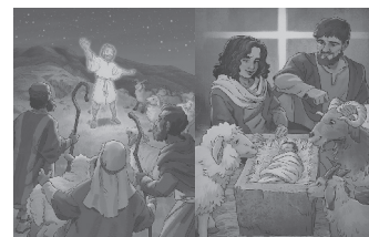
Lesson 1 Visual 4