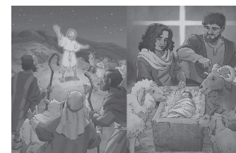
Lesson 1 Visual 4

Jesus Christ is truly the most important person in history. One reason is that He was willing to become unimportant to show His love for God the Father and us by coming to earth. Jesus set aside His own comfort and feelings and put others before Himself. He submitted to the Father’s plan for Him to be born as the Savior of the world!