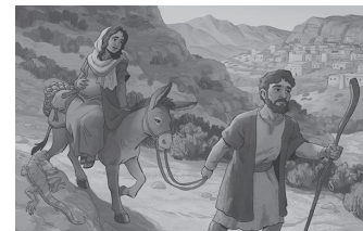
Lesson 1 Visual 3

Jesus would grow up and die on a cross as punishment, but not punishment for anything He did wrong. Jesus never, ever did anything wrong. He died on that cross because He loved us. He died to take the punishment for all the wrong things we think, say, or do. He died to save us from our sin. Jesus is the Savior!