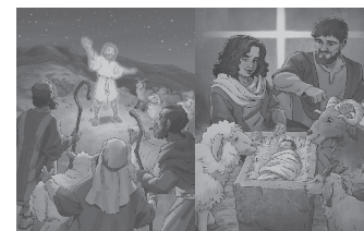
Lesson 1 Visual 4