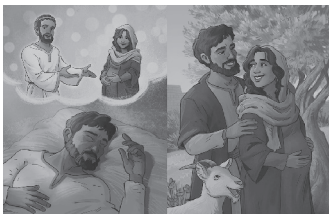
Lesson 1 Visual 2