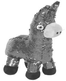
Plush Sequin Llama (33855)