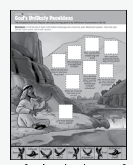
Student book page 6

Plan to order Strong Kids at Home every quarter. It provides a valuable connection between your classroom and the home.