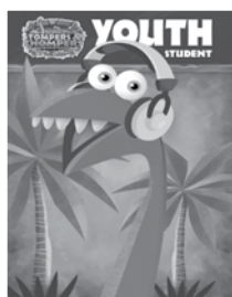
Youth Student Book (33364)

The next lesson will cover God's plan for humans in more detail. A preview of God's big-picture plan for us is that He wants us to know Him, love Him, and love others.