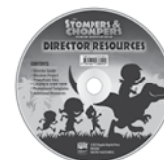
Director Resources CD (33302)

Open in prayer and teach with an open Bible.