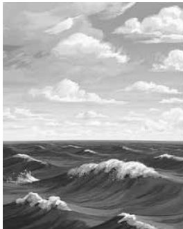
Lesson 1 Visual 2a