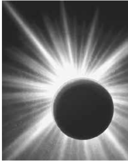
Lesson 1 Visual 1