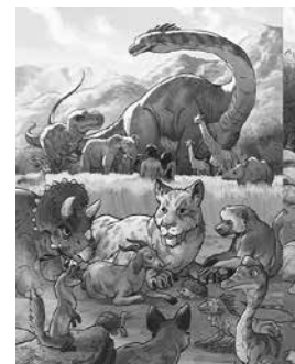
Lesson 1 Visual 4a