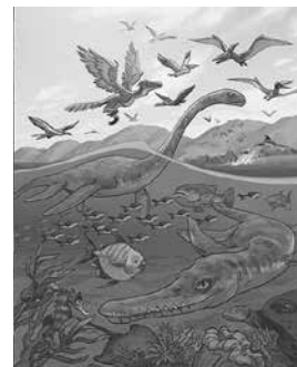
Lesson 1 Visual 3b

God created our beautiful world with all its beautiful flowers, its delicious fruit, and all the kinds of birds and animals. And He made each of us too. God made us and He loves us! He wants us to love Him too. The creation God made shows He is powerful and wise and loving. He made us and knows what is best for us. So we should love and obey Him. We learn how to love and obey God from His