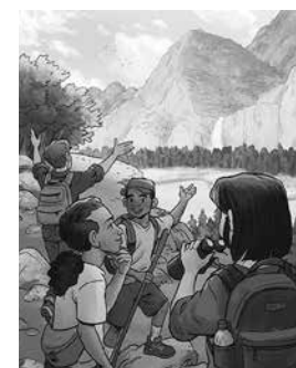
Lesson 1 Visual 4b