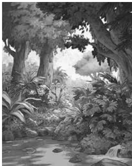
Lesson 1 Visual 2b