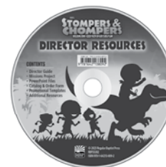
Director Resources CD (33302)

Open in prayer and teach with an open Bible.