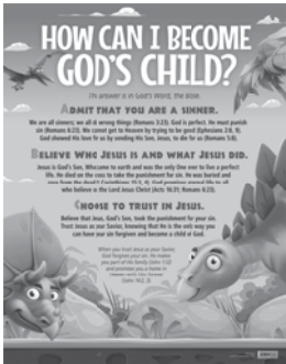
Salvation Poster (33336)