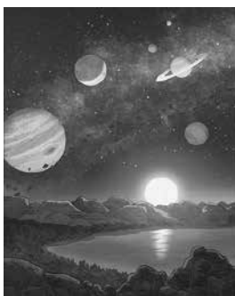
Lesson 1 Visual 3a

If we had been there at the very beginning, what would we have seen? Close your eyes tightly. Put both hands over your eyes. What do you see? Everything was completely dark. No beautiful flowers, no trees, no sunshine, no dogs or kittens or birds. But God had a plan to make a beautiful world.