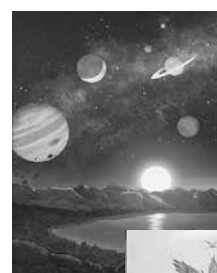
Lesson 1 Visual 3a

The sun is 864,000 miles in diameter, and its temperature is about 10,000° Fahrenheit.