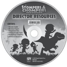
Director Resources CD (33302)

ASK: Would you believe me if I told you the verse was written on these blank sheets of paper? You'll have to trust me about that, because your eyes can't see the words. ACTIVITY: Student volunteers take turns dipping a foam paintbrush in the grape juice and painting over each sheet of paper. When all the words are revealed, the class works together to arrange the words in the correct order.