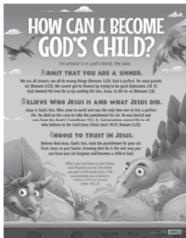
Salvation Poster (33336)

ACTIVITY: Ask a student volunteer to find an item to symbolize what God did on day 7 and place it next to number 7 on the table.