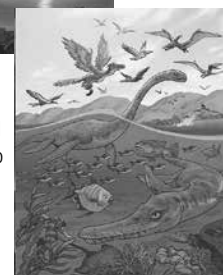
Lesson 1 Visual 3b