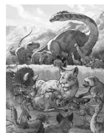
Lesson 1 Visual 4a