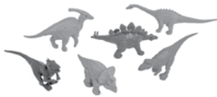
Tiny Diny Dino Toys (33434)

God created dinosaurs by the power of His word.