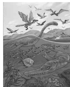
Lesson 1 Visual 3b

God created our beautiful world with all its beautiful flowers, its delicious fruit, and all the kinds of birds and animals. And He made each of us too. God made us and He loves us! He wants us to love Him too. The creation God made shows He is powerful and wise and loving. He made us and knows what is best for us. So we should love and obey Him. We learn how to love and obey God from His