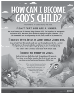
Salvation Poster (33336)

God made so many wonderful birds and animals: Sparrows, eagles, flamingos, herons, swans, robins, ostriches, emus. Dinosaurs, tigers, anteaters, giraffes, kangaroos, cows, dogs.