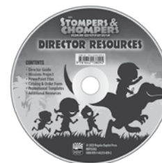
Director Resources CD (33302)

Open in prayer and teach with an open Bible.