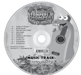
Music CD (33330)