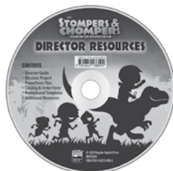
Director Resources CD (33302)