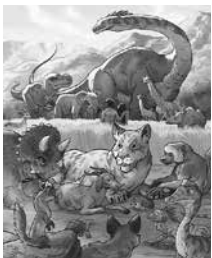
Lesson 1 Visual 4a

DISPLAY: Show visual picture 1 or PowerPoint visual 1.