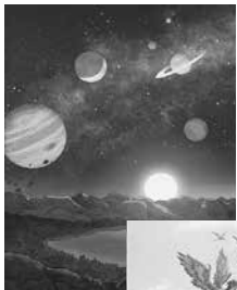
Lesson 1 Visual 3a