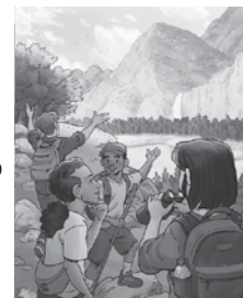
Lesson 1 Visual 4b

PRAY: Thank God for His Word, the Bible, and for the power of God's great words.