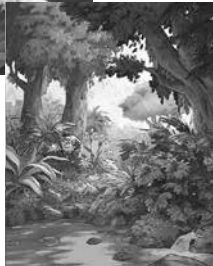
Lesson 1 Visual 2b