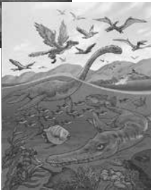
Lesson 1 Visual 3b