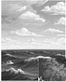
Lesson 1 Visual 2a