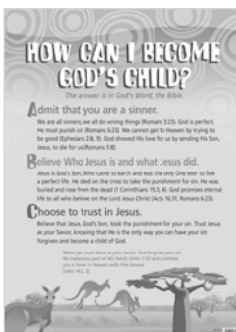
Salvation Poster (33036)

God asked Moses to do a really big and scary job. But now he knew that God would be with him. Encountering God's glory would help Moses have the confidence to get started on the job God wanted him to do. When God calls you to do a job for Him—like inviting a friend to VBS or being kind to the new kid on your sports team—God can help you too.