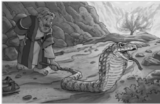
Lesson 1 Visual 3