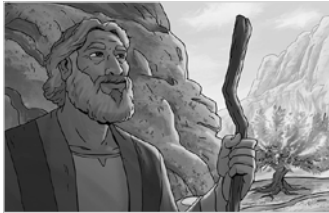
Lesson 1 Visual 4

God: Moses, pick up the snake by the tail.