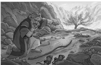
Lesson 1 Visual 2

God: I have seen the suffering of My people in Egypt. And I have come to