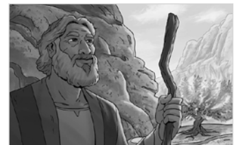
Lesson 1 Visual 4