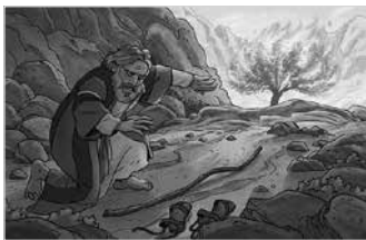
Lesson 1 Visual 2

But Moses was not holy. Moses had done wrong things. The Bible calls the wrong things we do "sin."