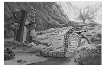
Lesson 1 Visual 3

God promised to be with Moses. And do you know what? The amazing, powerful God will be with you and me too!