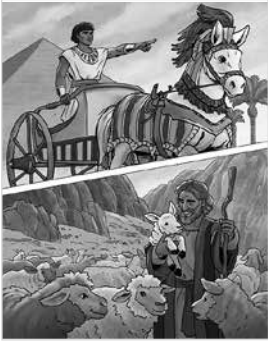
Lesson 1 Visual 1

DISPLAY: Show visual picture 1 or PowerPoint visual 1. Point to Moses in the first half of the picture.