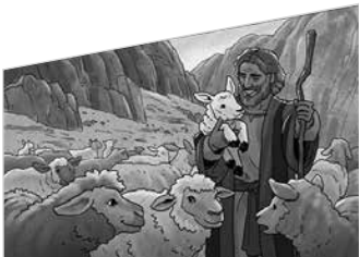
Lesson 1 Visual 1b