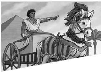
Lesson 1 Visual 1a

ACTIVITY: Act out Exodus 3:2–6. Read directly from the text. If desired, set up a "burning bush" in the center of your room made of crumpled and heaped red and yellow plastic table covers. Gather your students around in a circle. Each student pretends to be Moses while acting out his reactions. Encourage the students to answer, "Here am I" and to take off their shoes, and to act afraid when they realize it is God speaking.