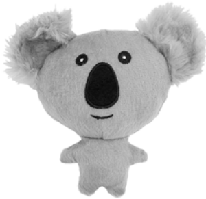
Cozy Koalas (33138)