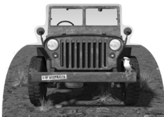
Kookaburra Coast Cutouts (33114)

A cell phone flashlight is effective, because the light is focused and intense.