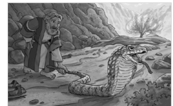
Lesson 1 Visual 3