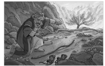
Lesson 1 Visual 2

Boys and girls, do you ever feel like you're not important? We all think that way