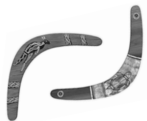
Kookaburra Coast Cutouts (33114)

Hold your Bible open as you teach the verse, emphasizing that it is from the Bible.