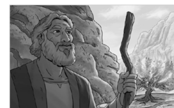
Lesson 1 Visual 4