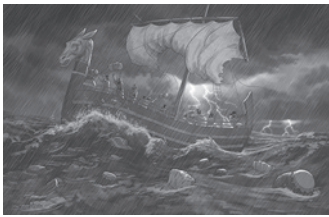
Lesson 1 Visual 2

Sometimes people draw straws, and the person who gets the shortest straw is the chosen one. Long ago, people used stones. If there were ten people, they would use nine white stones and one black stone. The chosen person was the one who