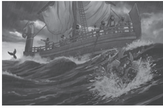
Lesson 1 Visual 4

The wind was blowing! The waves were crashing onto the ship! The men picked up Jonah—and threw him into the sea!