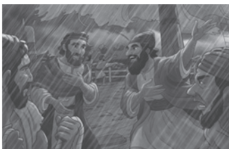
Lesson 1 Visual 3