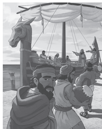
Lesson 1 Visual 1

◀ Teacher Tip Open in prayer and teach with an open Bible.