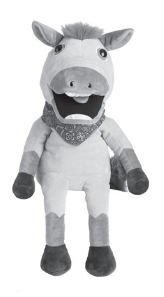
Charlie the Horse (32149)