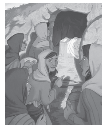
Lesson 1 Visual 1

Visual Book PowerPoint Download (32107EB) from RBPstore.org.