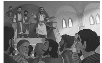
Lesson 1 Visual 3

But that was not all! The good news of God’s love changed those people that day. They wanted to find out more about Jesus and how to obey God. They ate