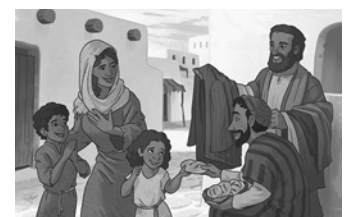
Lesson 1 Visual 4