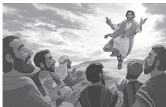
Lesson 1 Visual 2