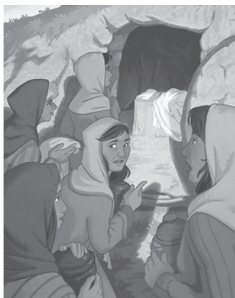
Lesson 1 Visual 1

Visual Book PowerPoint Download (32107EB) from RBPstore.org.