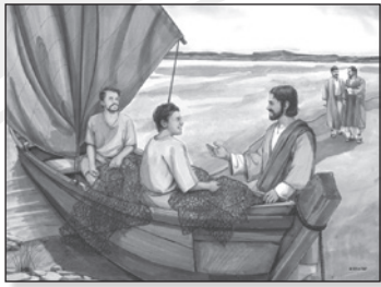
Bible Teaching Pictures

It's GROW Time is a three-year through-the-Bible curriculum. This third year covers the timeline from the book of Matthew through the end of the New Testament. The dual emphasis of the curriculum is spiritual growth and understanding the Bible timeline with particular attention to the history of redemption.