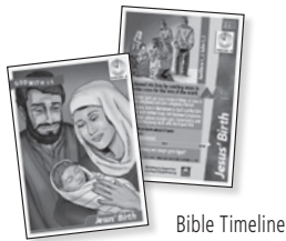
Bible Timeline Collector Cards