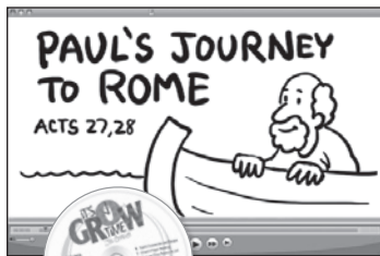
Animated Bible Accounts DVD