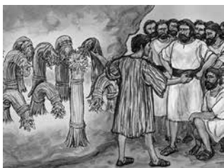
Lesson 1 Visual 2