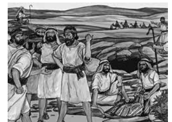
Lesson 1 Visual 4