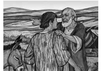
Lesson 1 Visual 3