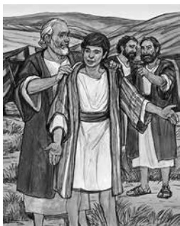
Lesson 1 Visual 1

Joseph had a dream. He dreamed that he and his brothers were working together, tying grain into bundles. Joseph's bundle of grain stood straight up and tall. But his brothers' bundles of grain bent down low.