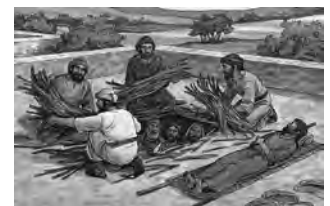
Lesson 1 Visual 2