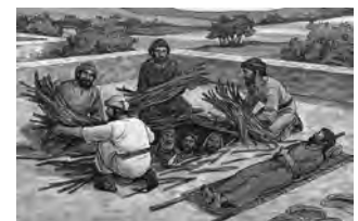
Lesson 1 Visual 2