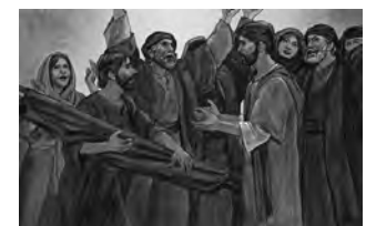
Lesson 1 Visual 4