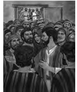
Lesson 1 Visual 1